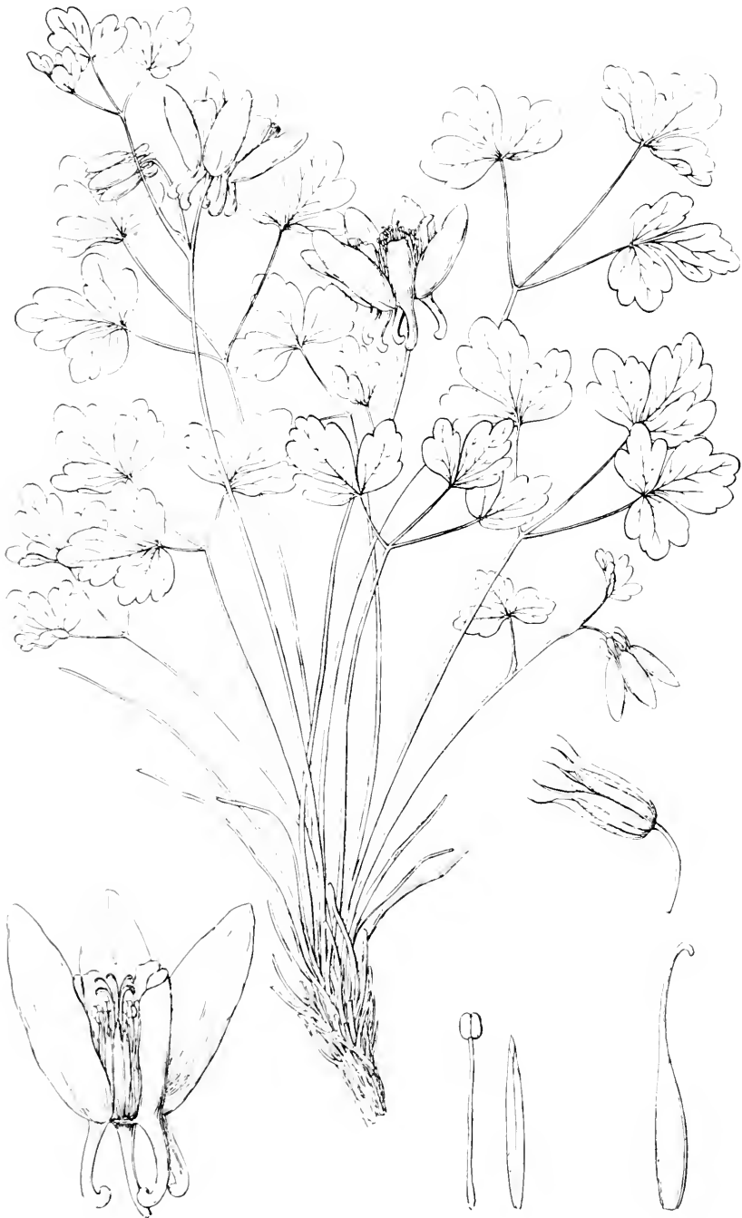
AQUILEGIA SAXIMONTANA Rydberg.